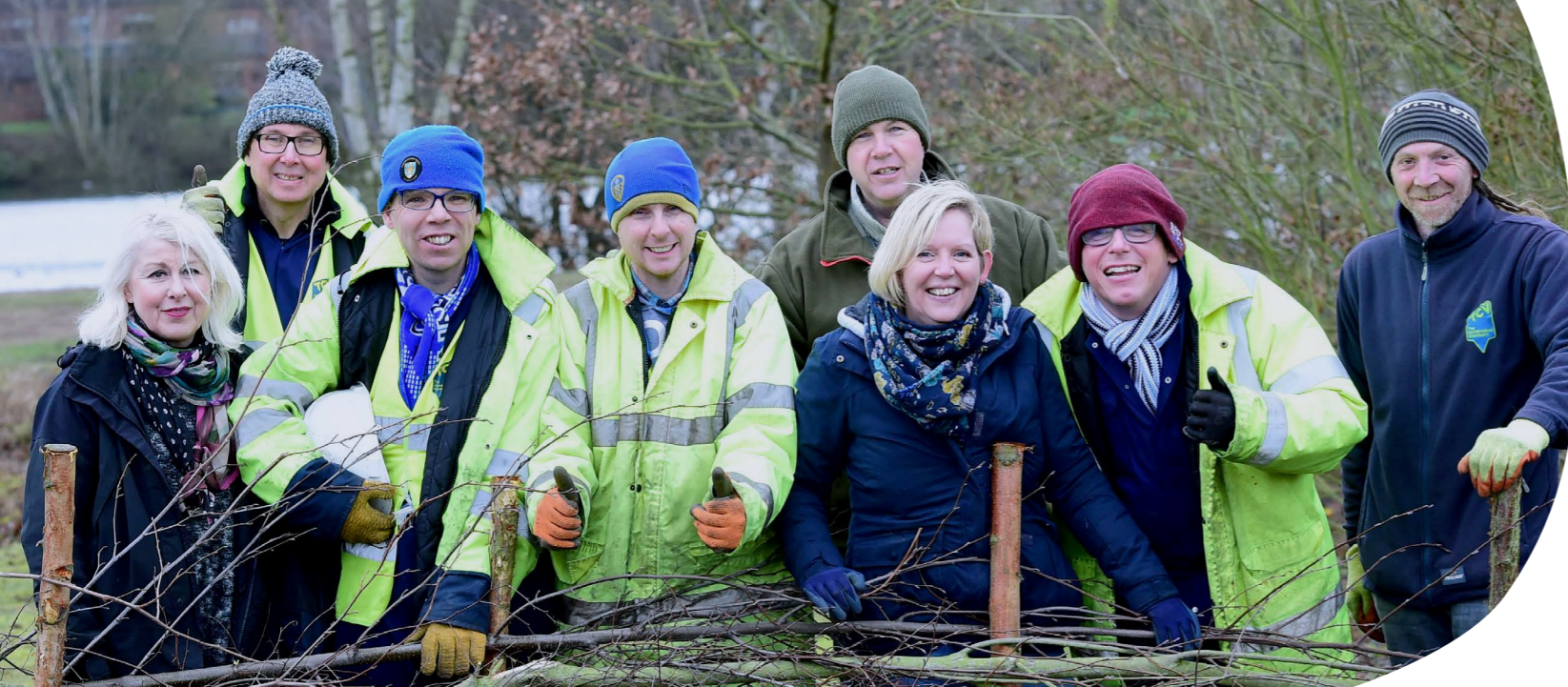
LEFT: These volunteers at Hartsholme Country Park are doing something they enjoy while contributing to the community.