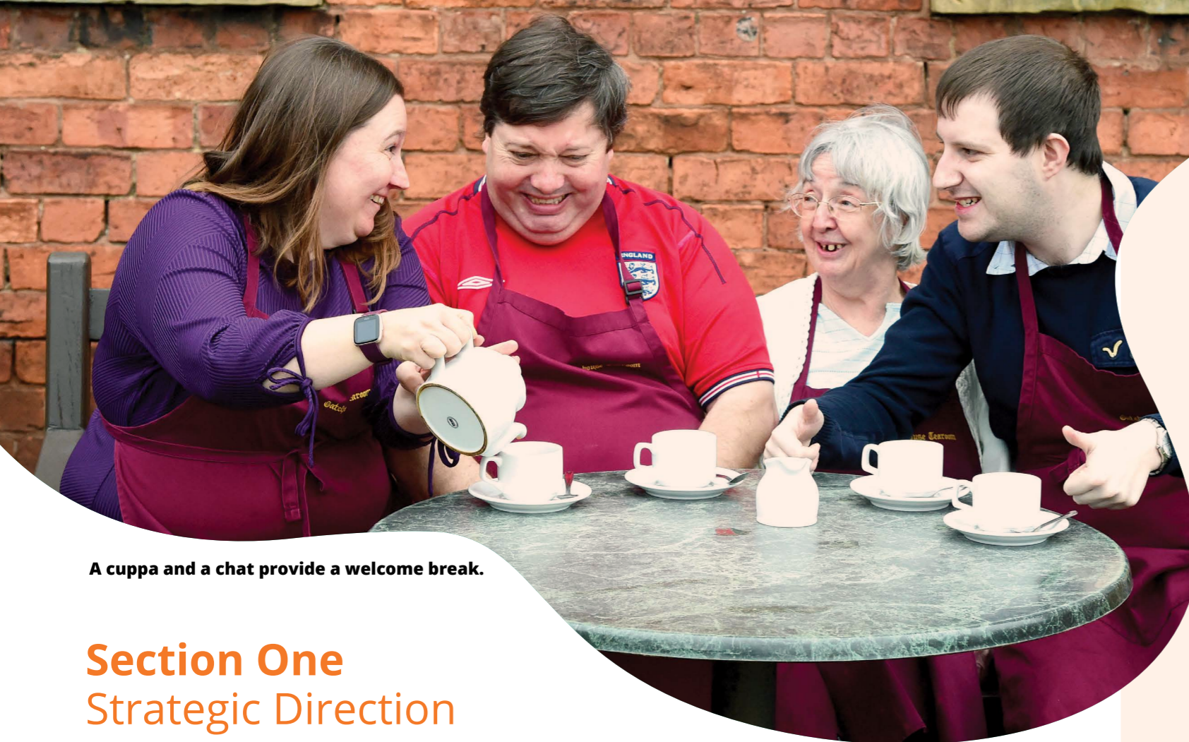
A cuppa and a chat provide a welcome break.