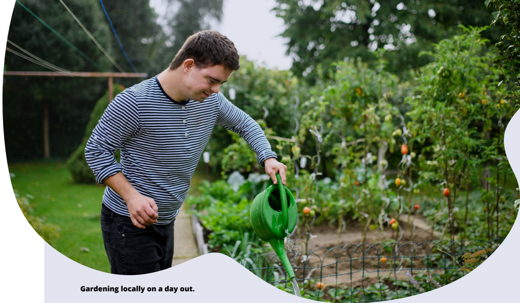
Gardening locally on a day out.

In order to expand the use of our Day Service buildings, to make them more accessible for people with complex needs and to ensure they are places and spaces we can be proud and to ensure people can also access wider activities in their local communities we recognise that there will be a need for additional capital investment.